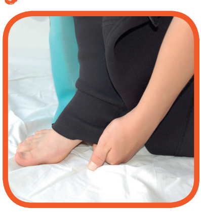
Put one foot through at a time