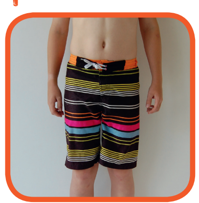
Change into your swimwear