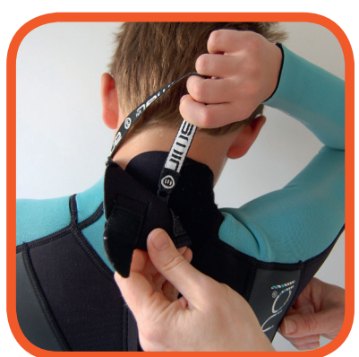
Do the zip up and the velcro. You might need some help